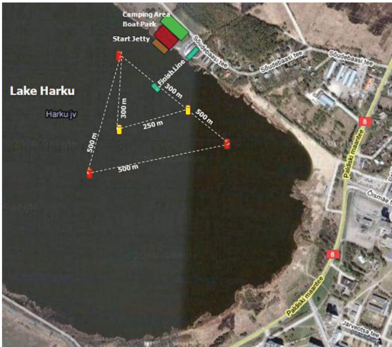
Map of the race course